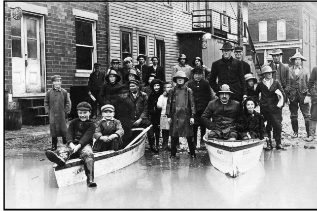
Evansport residents took to rowboats during the 1913 flood. This photograph was taken on First Street, looking west toward Main Street.

9. On May 2, 1885, Nicholas King purchased Lots 37-40, 121 and 122 at the southeast edge of Evansport. King ran a sawmill and cider mill (where apples were squeezed into cider) at this location next to the Tiffin River for many years, selling the property to Lingle & Ruffer in 1909.