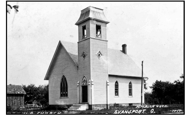
The "Radical" Evansport United Brethren congregation built this church in 1898 at the corner of West and Fifth streets. It was dismantled in the 1930s.

5. In 1889, the United Brethren denomination split nationally over the issue of membership in "secret societies" such as the Masons. This division impacted the Evansport congregation. In 1898, the so-called "Radical" faction of the Evansport United Brethren con-